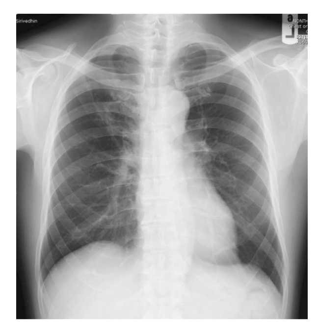
Figure 2 PA chest radiograph: December 22, 2013.